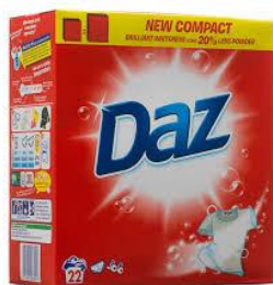
30ml soap powder