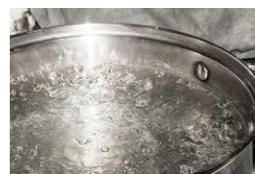
60ml of hot water