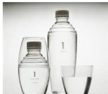
1 litre water